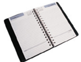
Caption story cdescribing picture or graphic.