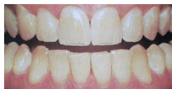
Before Nite White

Summer offer: The advanced, custom tray "Nite White" system, usually $600 is now only $350. Call and you can have a whiter smile in a few short weeks!